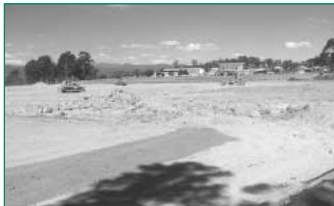
From the Archives – Athletics Oval under construction, mid 1970's.